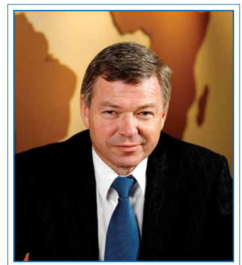
Keynote Speaker, former Prime Minister of Norway, Kjell Magne Bondevik

Mr. Bondevik was a member of Parliament from 1973-2005 representing the Christian Democratic Party, and was leader of the Christian Democratic Party 1983-1995. Mr. Bondevik is a Theological Candidate from Norway's Free Faculty of Theology. In 1979 he was ordained as a minister in the Lutheran Church of Norway. He served as the UN Secretary General's Special Humanitarian Envoy for the Horn of Africa during 2006-2007.