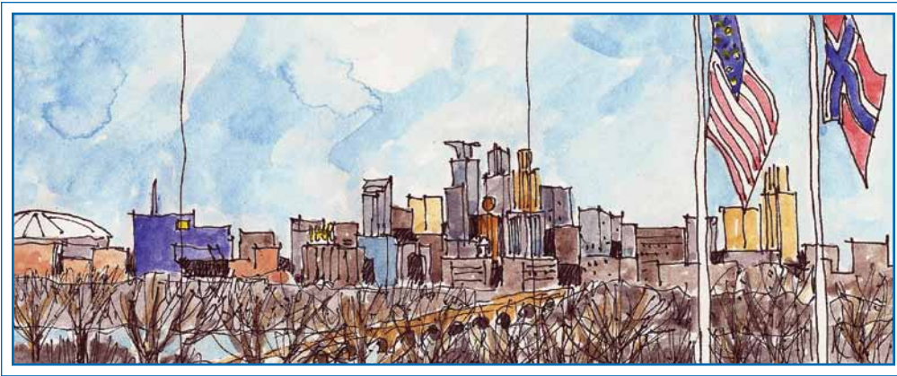
Architect Dewey Thorbeck's sketch of the view of Minneapolis from the proposed Norway House site.